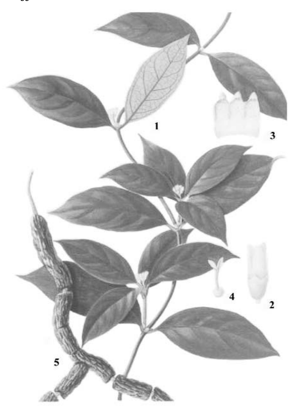
From Qian (1996) 1. flower twig; 2, flower; 3, stamen in dissected flower; 4. pistil; 5, root