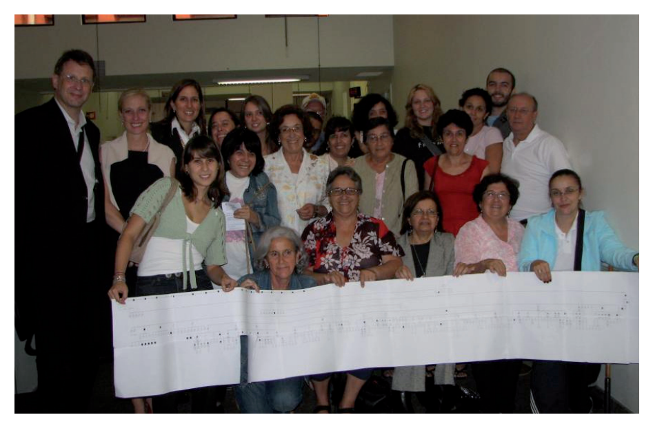
Figure 2. A gathering of subjects from cancer prone families, proudly showing their familial tree spanning 8 generations