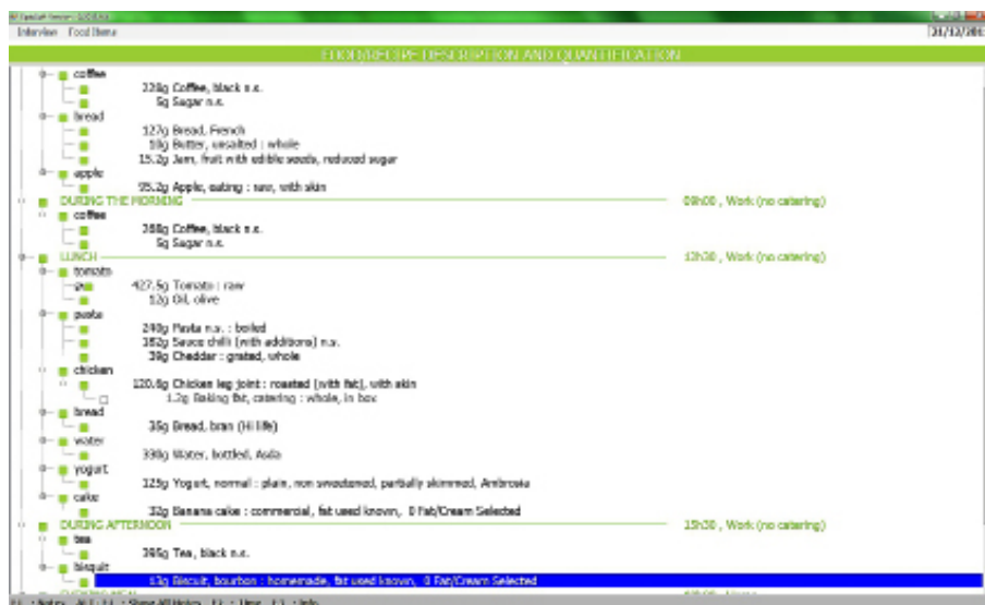
Figure 1. Typical screen of a 24-hour recall interview of the food/recipe description and quantification step using EPIC-Soft

To respond to the need for wide dissemination of the EPIC-Soft application, while preserving its core concepts of standardization and integrity, a centralized web-based platform (EPIC-Soft Methodological Platform (EMP)) hosted at IARC is under development (the concept has been finalized and the technical implementation is ongoing). This comprehensive platform will provide full support to conduct international nutritional studies in Europe and elsewhere, using common tools and procedures to collect, control and handle dietary interview data.