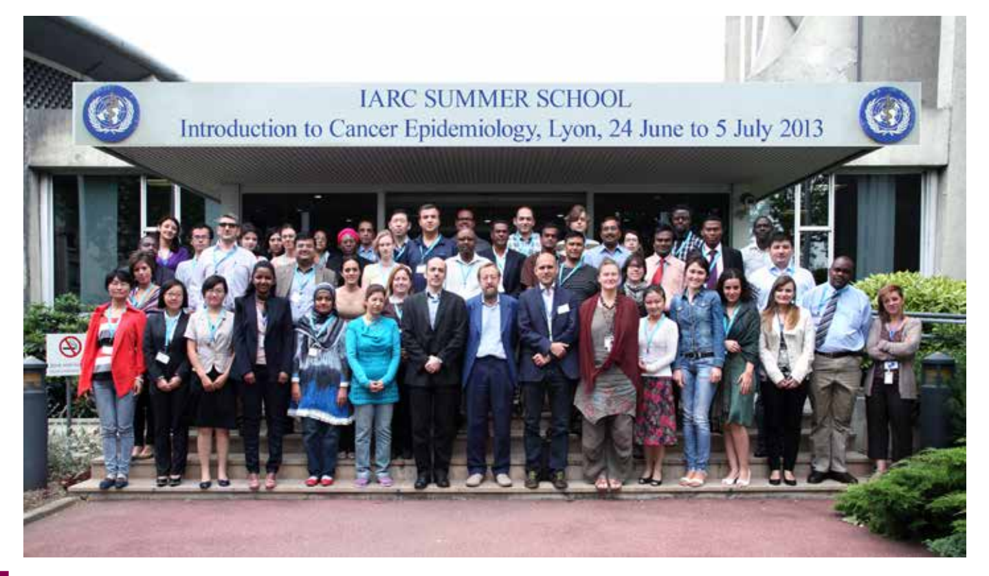
Figure 2. IARC Summer School 2013: Introduction to Cancer Epidemiology.

A balance is sought between leaders in research and more junior staff, and between institutions or groups involved in cancer monitoring, in the evaluation of care practices and preventive interventions, or in etiological research.