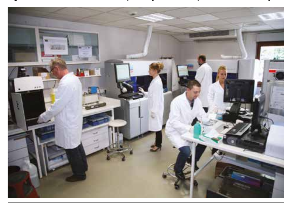
Figure 1. Activities in the IARC biobank pre-analytical services platform. © IARC/R. Dray.

An Agency-wide service of checking and performing basic maintenance on laboratory pipettes was introduced to help researchers and technicians better control their experiments.