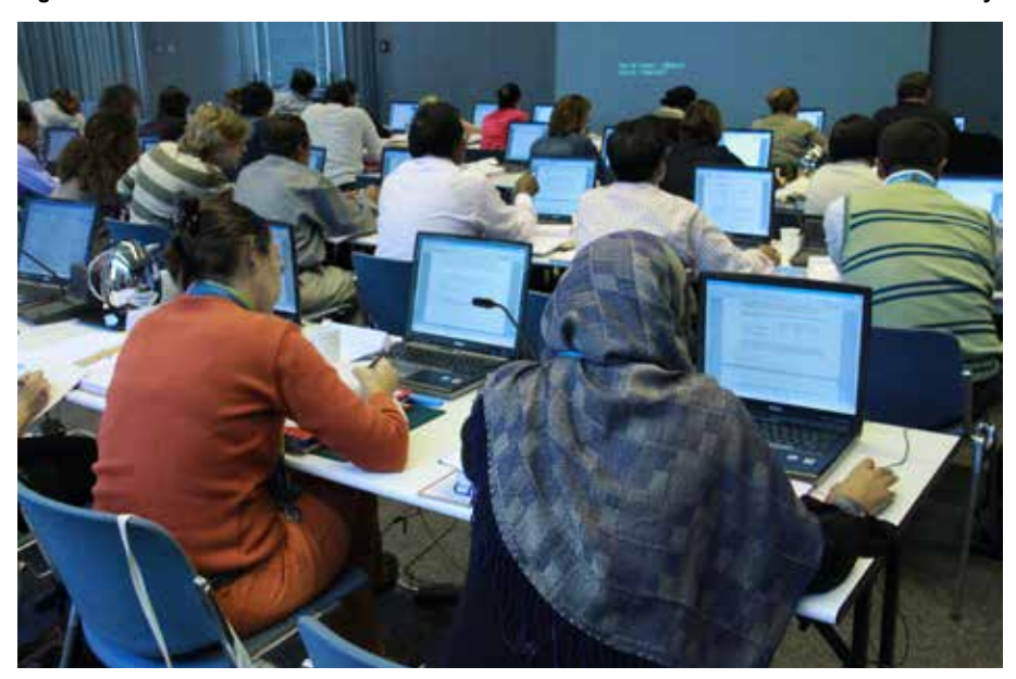
Figure 3. IARC Summer School 2013: Measures of occurrence and association.

Specialized and advanced courses are sometimes organized by IARC's scientific Groups, often with the support of ETR. The majority of these courses are associated with collaborative research projects, where IARC is transferring skills necessary for the conduct of the projects. This will subsequently enable the implementation of the research findings in the countries concerned. Specialized methodological courses held at IARC include Statistical Practice in Epidemiology with R, in collaboration with members of the R development team, and courses on the EPIC-Soft® 24-hour dietary recall and the CanReg5 software (see eLearning below). In some instances, specialized courses are coorganized with external partners and held at diverse locations throughout the world (Table 3). Over the biennium, specialized and advanced courses enabled the training of a total of approximately 700 scientists and health professionals.