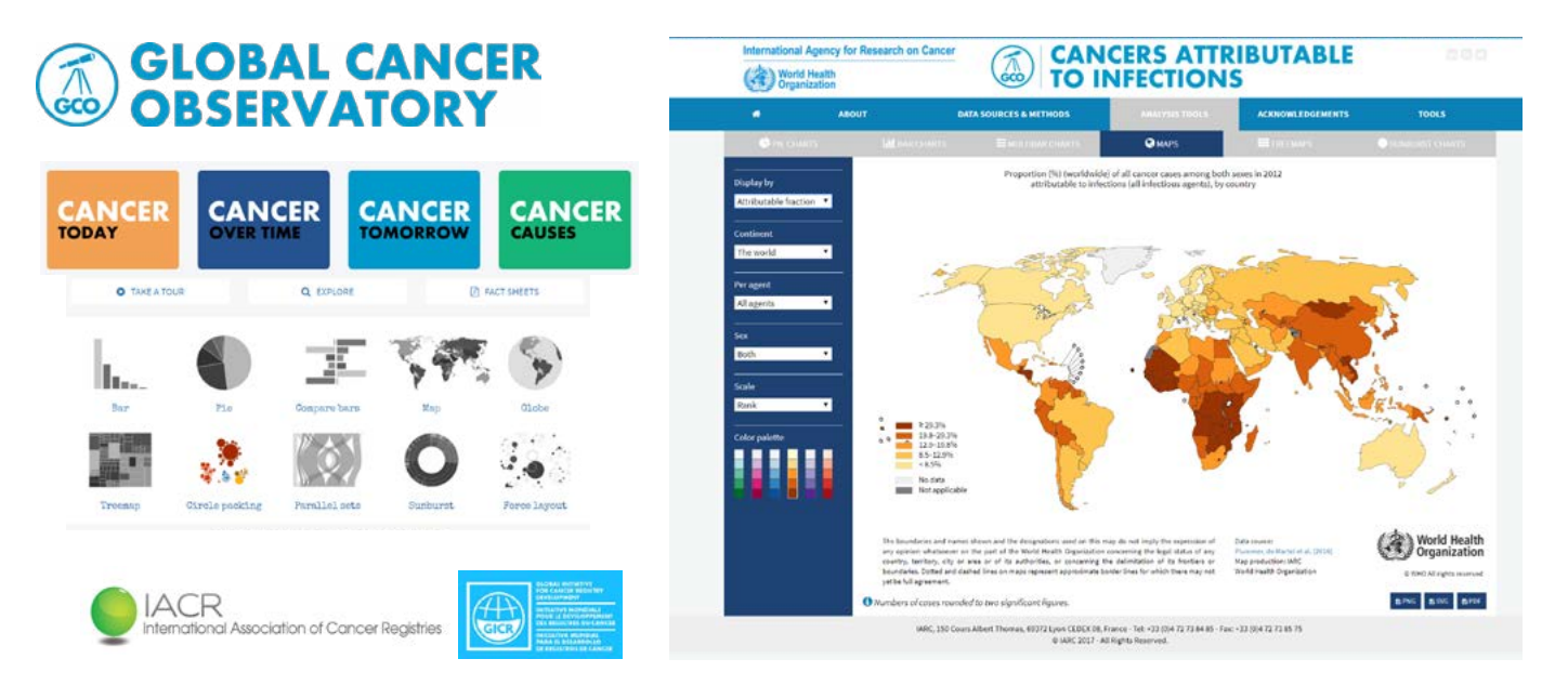
Figure 3. Screenshots of (left) the four subsites of the Global Cancer Observatory (GCO; <u>http://gco.iarc.fr</u>); (right) a global map from the GCO's Cancer Causes subsite showing the proportion of cancers attributable to infections in 2012.

The GLOBOCAN database, built on the data from cancer registries worldwide, permits cancer statistics to be available at the national level through the GCO's Cancer Today subsite. A validation study comparing GLOBOCAN estimates with high-quality recorded national incidence data in Norway emphasized the utility of trends-based estimation approaches and population-based data to accurately estimate incidence (Antoni et al., 2016).