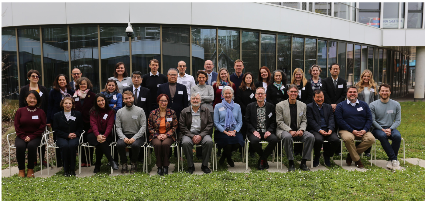
The IARC Monographs Working Group and Secretariat for Volume 133, Anthracene, 2-bromopropane, butyl methacrylate, and dimethyl hydrogen phosphite, which met in Lyon, France, on 28 February to 7 March 2023.